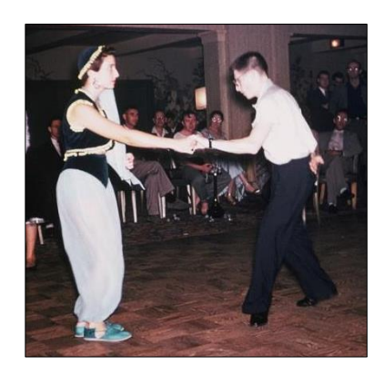
Harlan Ellison cutting the rug